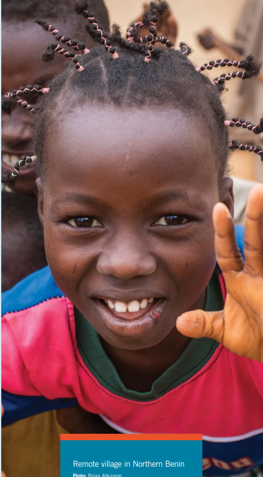
Remote village in Northern Benin