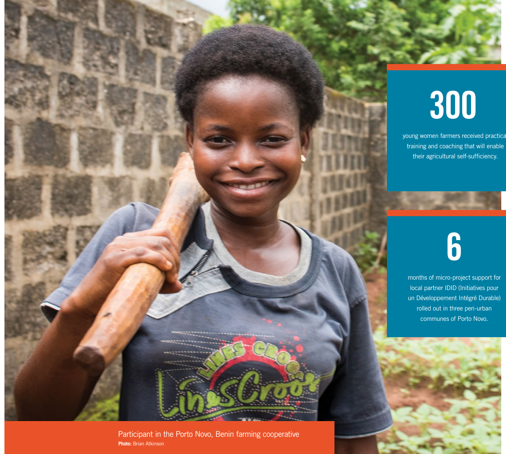
Participant in the Porto Novo, Benin farming cooperative

months of micro-project support for local partner IDID (Initiatives pour un Développement Intégré Durable) rolled out in three peri-urban communes of Porto Novo.