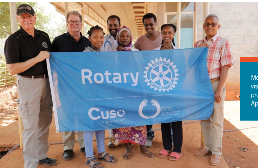
Members of Rotary District 7070 visit Cuso's Midwives Save Lives program in Assosa, Ethiopia, April 2019.

Cuso International would like to extend a heartfelt thank you to Rotary District 7070 for its generous financial support.