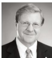
Hon. Lloyd Axworthy Board Chair

This past year I had the opportunity to gain deeper insight into our programs and our volunteers. I saw first hand how Cuso International creates lasting impact. The dedication of our partners to those they serve, the skills of our volunteers, and our committed and hard-working staff and Board of Directors are all key to our success. I met many of our alumni and donors who shared with me why they choose to support us and I thank them for their trust. It has been a wonderful year, with much to celebrate. The UN Sustainable Development Goals have given us increased momentum in establishing new partnerships here in Canada that will enable us to participate actively in reconciliation. We launched two new international programs: SCOPE in Colombia is supporting peacebuilding; the Tanzanian Local Enterprise Development program (T-LED) is improving prospects for small and medium enterprises. We are building on experience gained over fifty-five years and collaborating across sectors to address complex issues. Cuso International has been taking our collective learning and applying it to Canada's recent International Assistance Review—our decades of experience give us a breadth of knowledge that we hope will help guide this country's leadership on the global stage for years to come. It is a privilege to lead this incredibly important Canadian institution and support partners around the world as they achieve their goals.