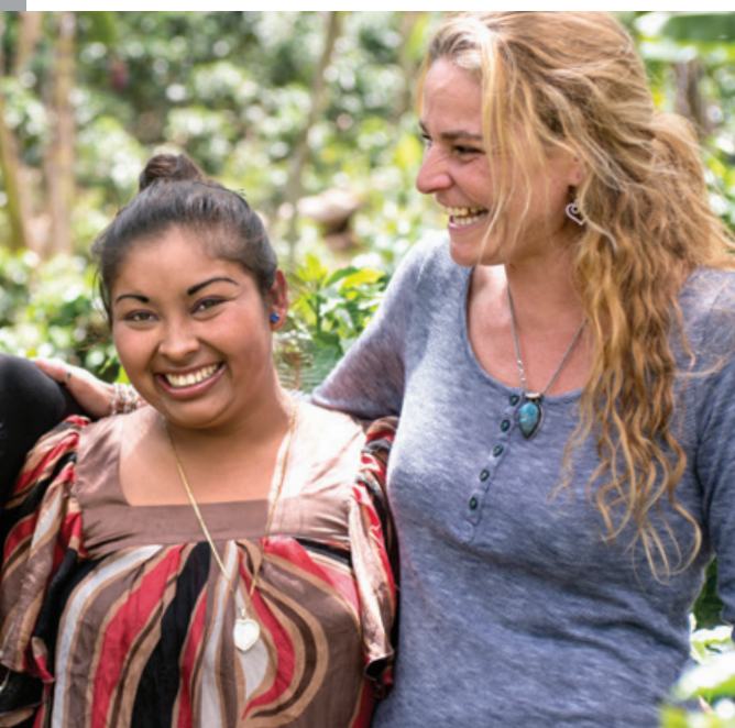
Top to bottom: Democratic Republic of the Congo, Myanmar, Nicaragua