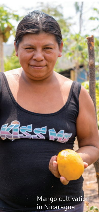
Mango cultivation in Nicaragua