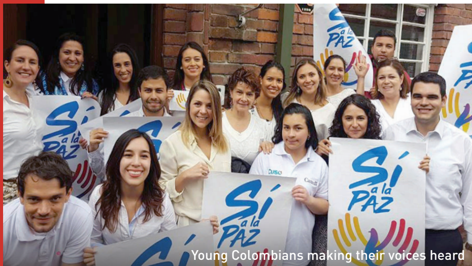
Young Colombians making their voices heard

Colombia is a country with a complicated, violent history, but there is new hope with the 2016 peace agreement between the government and the Revolutionary Armed Forces of Colombia (FARC).