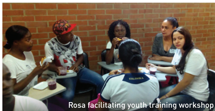
Rosa facilitating youth training workshop

It’s a fragile but optimistic time for a country that has seen almost 100 years of near-constant upheaval, and Cuso International is proud to play a role in building a lasting peace.