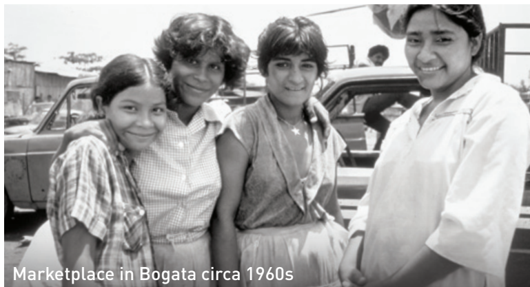
Marketplace in Bogota circa 1960s