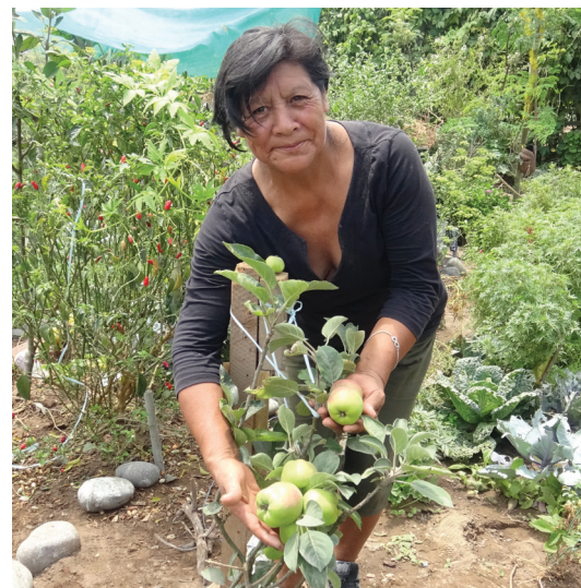
Tending to fruit trees in the heart of urban Lima.